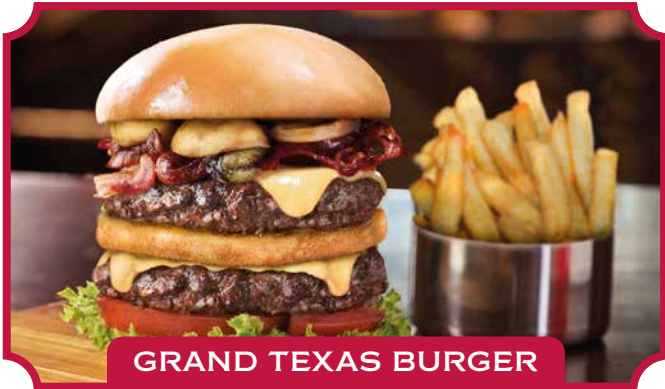
GRAND TEXAS BURGER

The largest and most delicious beef hamburger that you can imagine, with double meat, mushrooms, bacon, lettuce, tomato, Gruyère cheese, and mayonnaise. Served with French fries and coleslaw. 18.70 €