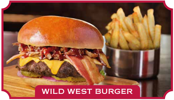
WILD WEST BURGER

Beef burger topped with Pulled Pork (Pulled pork is tender, smoked pork shoulder that is shredded and coated in a smoky, sweet barbecue sauce), melted cheddar cheese, bacon, onion and pickles. 15.50 €