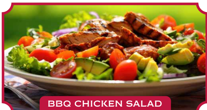
BBQ CHICKEN SALAD

Tasty grilled chicken breast with BBQ sauce, fresh lettuce, tomatoes, avocado, pineapple, cheese, and crispy bacon pieces. Dressed with our famous Country Vinaigrette. Big: 14.95 € · Medium: 11.95 €