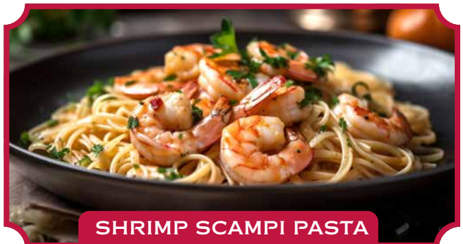
SHRIMP SCAMPI PASTA

Generous portion of shrimp lightly sautéed with garlic, fresh basil, roasted tomatoes, pesto, and a hint of chipotle. Served over linguine pasta with Asiago cheese. A unique flavor!. 17.75 €