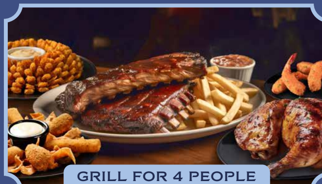
GRILL FOR 4 PEOPLE