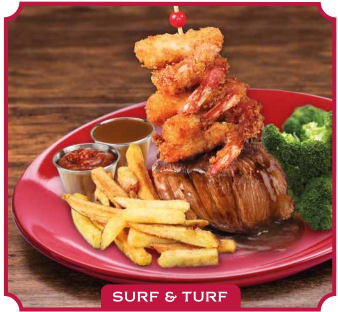
SURF & TURF

Fried and crispy, home made mashed potatoes with cheese and bacon or our baked potato with cheese, bacon and sour cream.