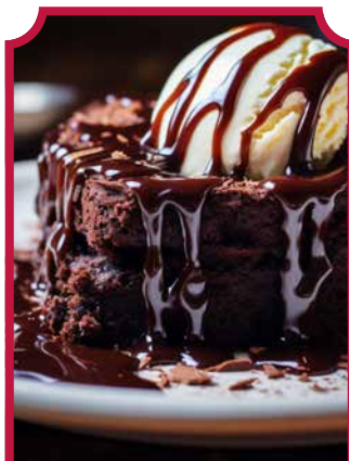
BROWNIE & SUNDAE