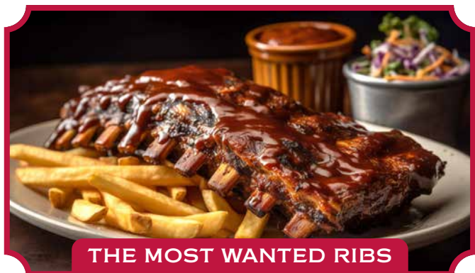
THE MOST WANTED RIBS

Our world awarded Baby Back Ribs, are grilled to perfection; generously smothered in our Texas Special BBQ sauce, served with French fries, ranch beans and coleslaw. 25,25 €